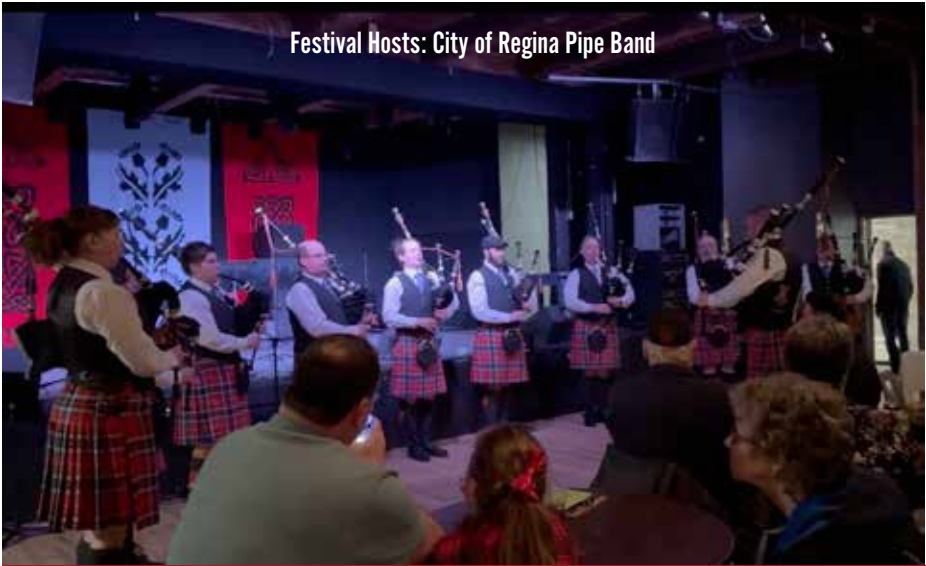
Festival Hosts: City of Regina Pipe Band